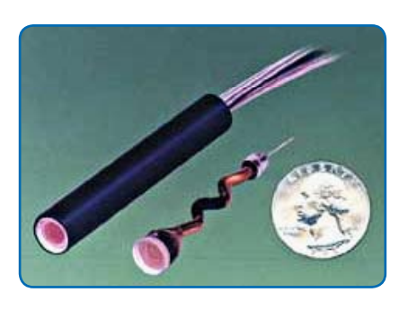
Small & robust, but highly sensitive: the Channel Photomultiplier (CPM) of Q8 Magellan.