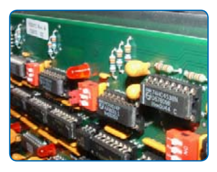
Data acquisition technology at its best ! High-speed collection and communication with broad bandwidth