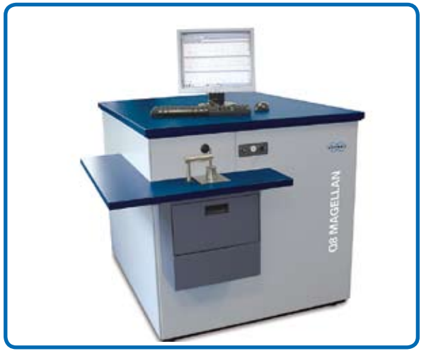
Q8 Magellan: the new name in the world of stationary spark emission spectrometers.

Making Q8 Magellan an even better value for money product with low total cost of ownership !